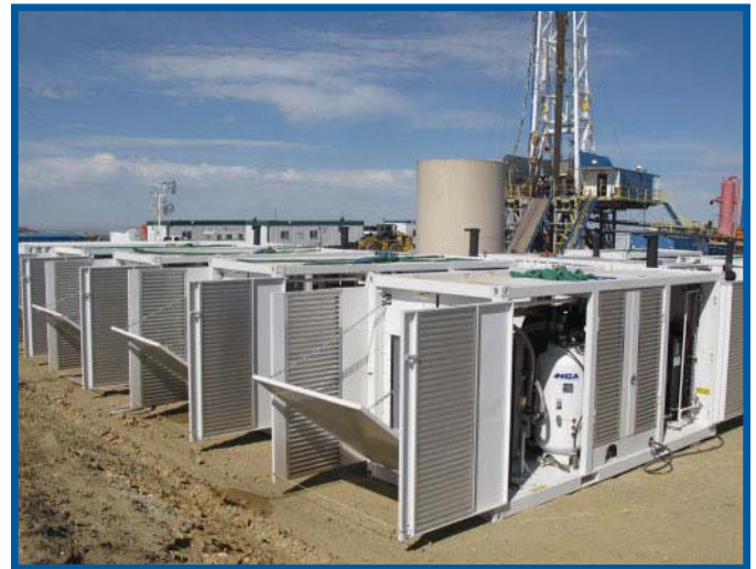
Containerized NCA Diesel Air Compressors with many client specific features

Our experienced and technically capable team can design and conduct training programs to meet your specific training needs at any location.