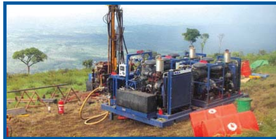
Helicopter Portable Modular Mineral Exploration Package