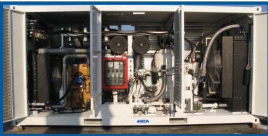
NCA High Pressure Diesel Compressor designed for Oil Field Application

Please contact us for any other special features required, which are not listed above.